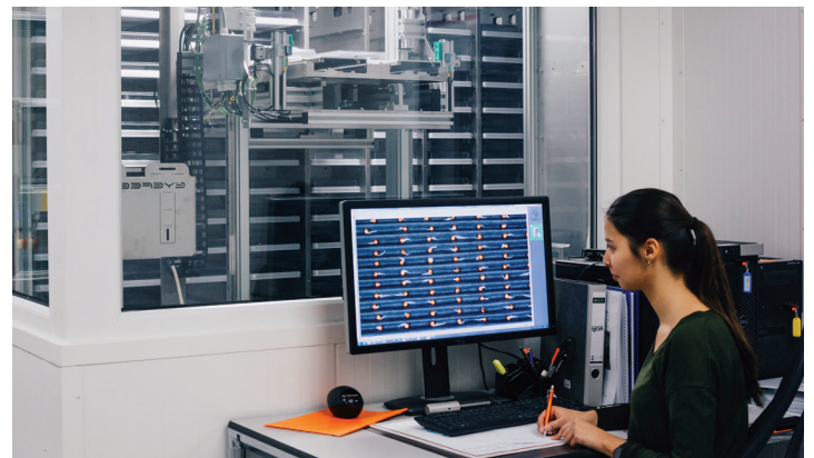
GESA the robot removes the germination trays from the store, photographs the germination progress and returns them to the shelf.